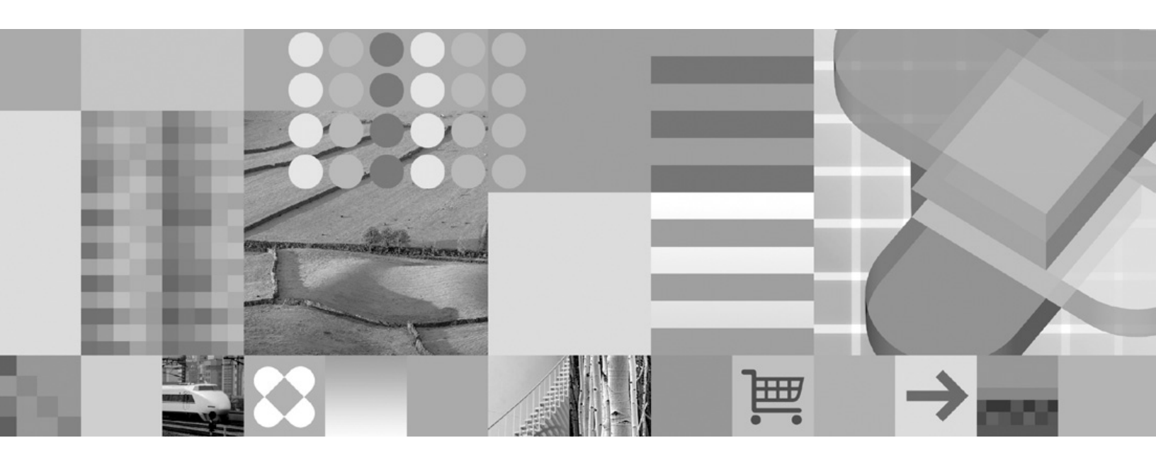
Developing Perl and PHP Applications

DB2 Version 9 for Linux, UNIX, and Windows