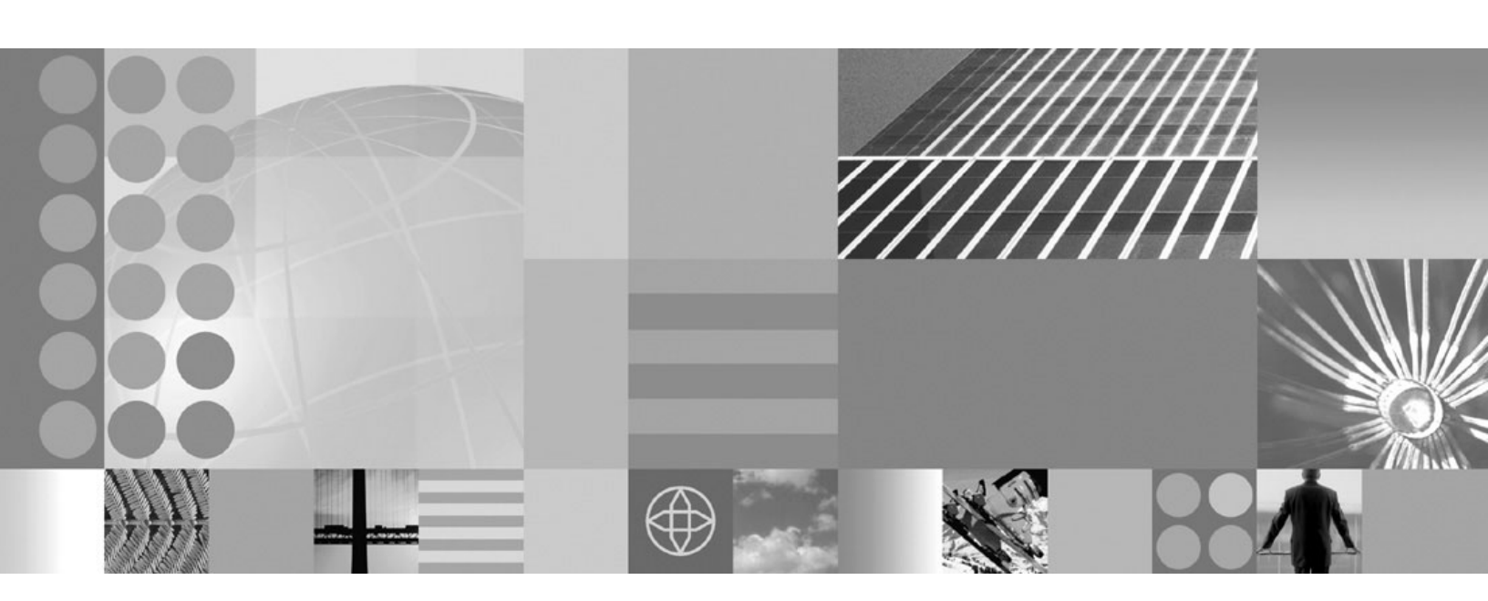
Migrating to Replication Version 9