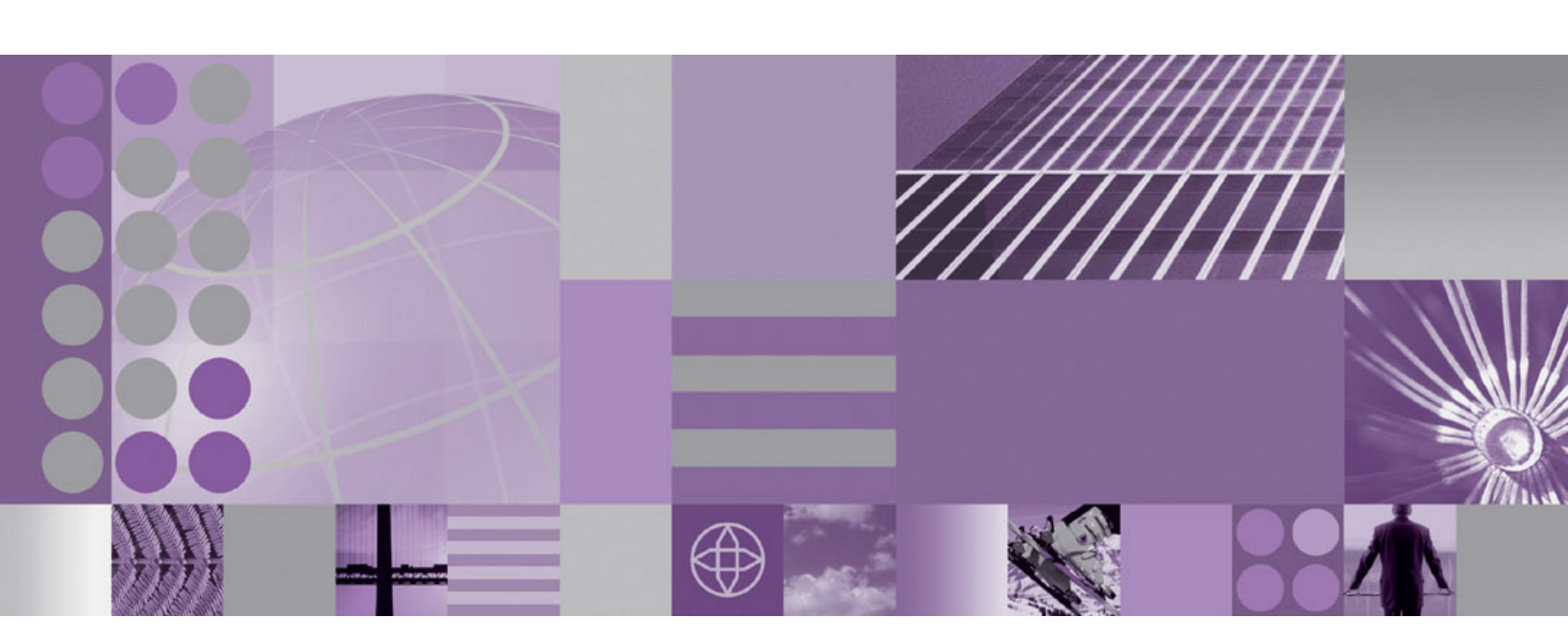
Migrating to Replication Version 9